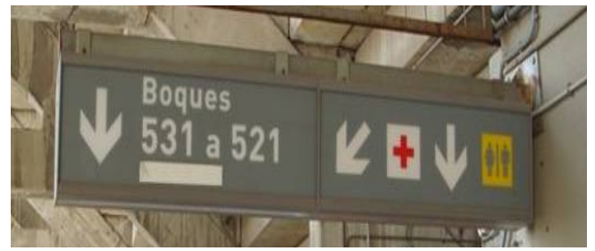
Directional Signage- Clear Pictogrammes.