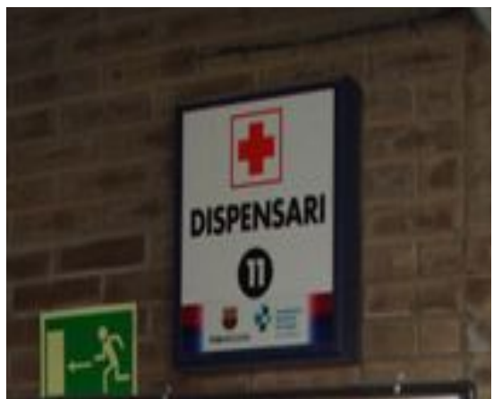
First Aid facility (Medical Room #11) exclusively for supporters in visitor sector