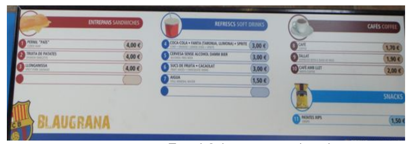
Food & beverage stands.