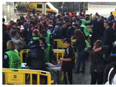
2) Body search at gates 46, 50, 51 and 52 with second ticket check with barcode at turnstile to enter into the Stadium

Visiting Supporters travelling in groups on charter buses from city centre should be dropped off in front of Access 21 on Carrer de la Maternitat.