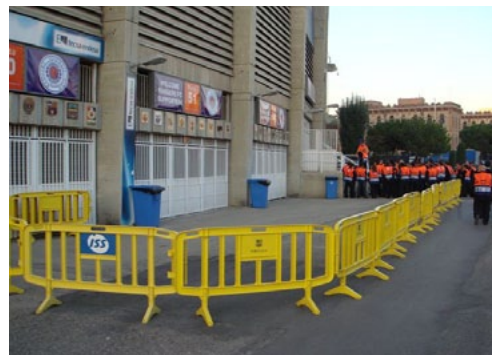
1) Supporters accompanied to gates (46, 50, 51 and 52)

In case of large numbers of visiting team supporters travelling to Camp Nou for a UEFA Champions League match, the Catalan Police and Club Security Department may decide to open Access 21 as an exclusive entrance for Visiting team supporters from 18:00 to 19:00 in order to speed up the ingress procedure. This will be discussed during the preparation phase.